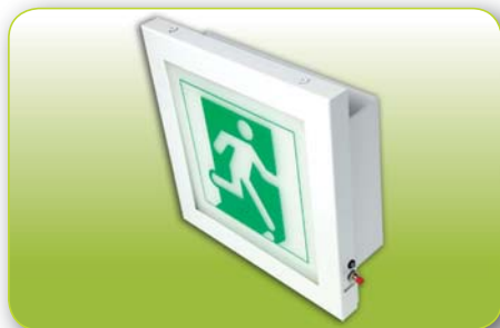
"CRYSTALITE" Cat. CX-LED-165-B-RL