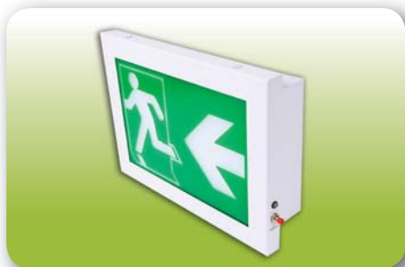
"CRYSTALITE" Cat. CX-LED-220-B-RL